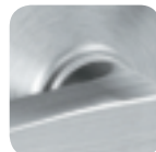
625 Bright Chrome