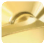
605 Bright Brass