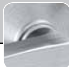
625 /US26 Bright Chrome